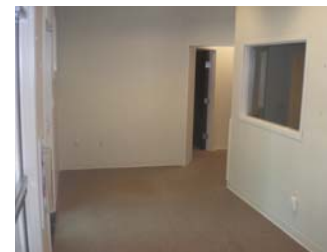
Reception / Check-in