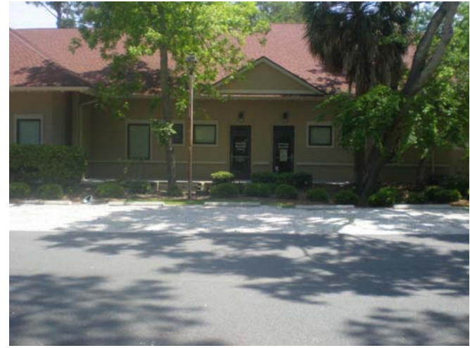
Main Entrance to Suites & D