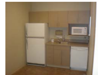
Kitchen / Break Room